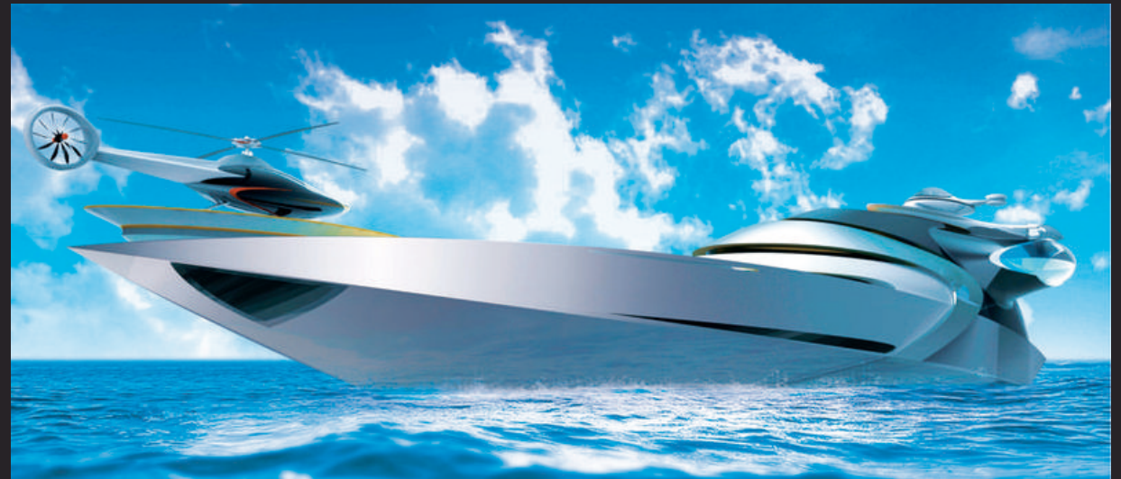
CCS Student work from Transportation Design

at CCS so please plan to obtain your travel Signature well-ahead of your intended dates of travel.