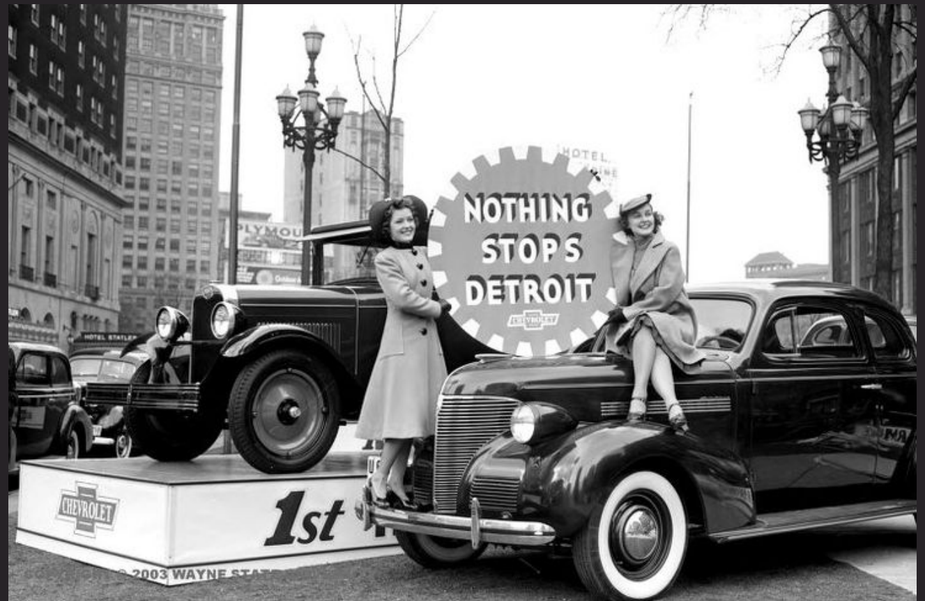
1939 Chevrolet advertisement

A drop below full-time enrollment, without prior RCL approval, for any reason, is a direct violation of F-1 student status and will result in the termination of your I-20. You will have 15 days to depart the country.