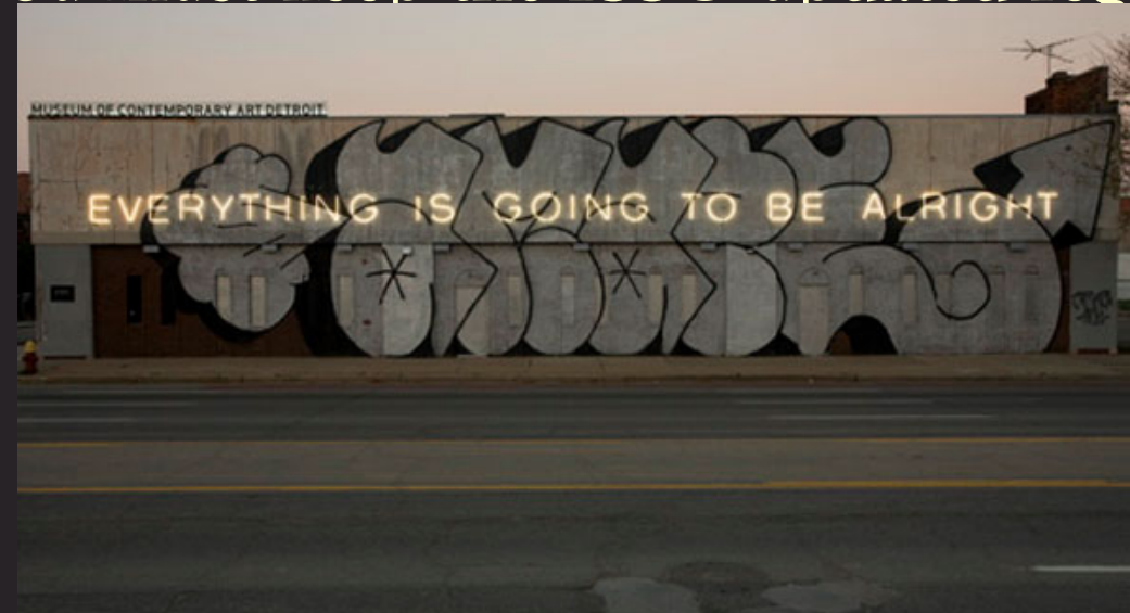
Museum of Contemporary Art, Detroit

To update any of these items, please make an appointment at the ISSO.