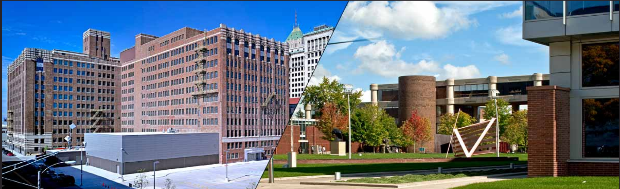
CCS Ford Campus and Taubman Center

US regulations require that non-immigrants update their home and local addresses within 10 days of any change. Failure to do so is a direct violation of visa status.