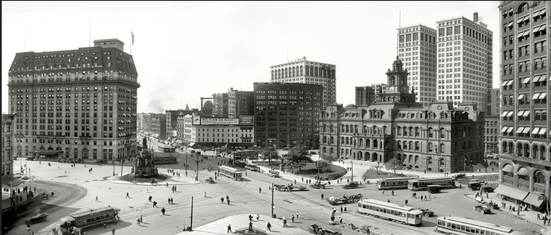
Campus Martius, downtown Detroit, circa 1915

SEVIS maintains the same information that is displayed on your I-20. In addition, CCS is required to report the following information about you: