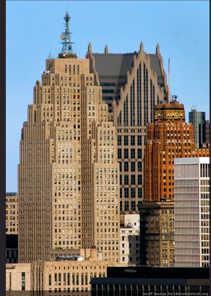
Detail of Detroit Skyline featuring Penobscot, 1 Detroit Center, Guardian, and 1 Woodward Ave buildings

The online system where DHS maintains information on Student and Exchange Visitor (SEVP)-approved institutions (like CCS) as well as non-immigrant students visiting the US to study in F-, M-, or J- status (like you!).