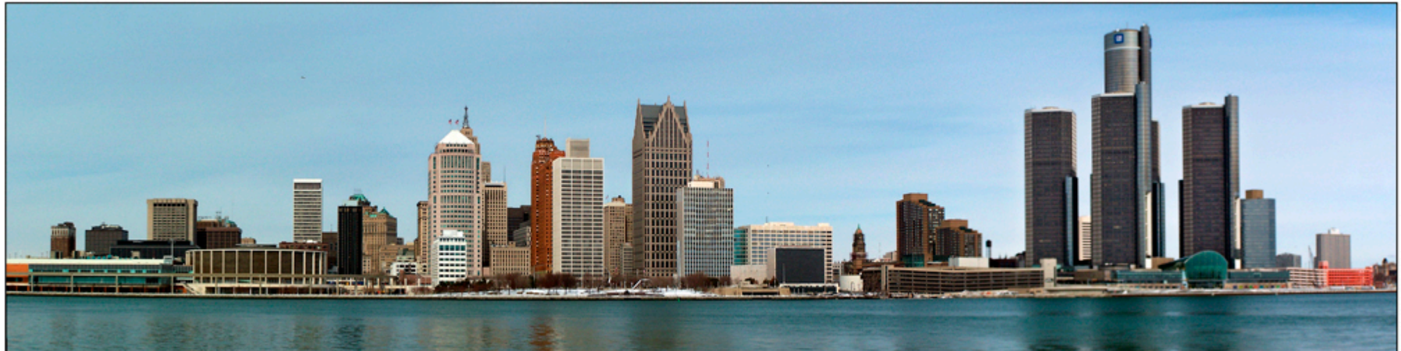
DETROIT WATERFRONT - WINTER

Non-immigrant students must comply with the regulations of the Department of Homeland Security (DHS) and are monitored in SEVIS.